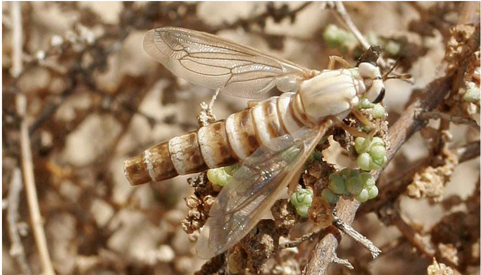
Figure 6. An unidentified fly from the family Mydidae. Whilst Mydidae had been observed in neighbouring Oman, before 2006 no records were known from the UAE.

Nemotelus along with a species of Odontomyia were recorded from the Sharjah Emirate (Howarth 2006, Howarth and Gillett 2008). The latter is the most speciose and cosmopolitan genus in the family and contains well over 200 species that are often found on flowers. The larvae are aquatic and feed on algae at the margins of fresh water (Bayless 2008).