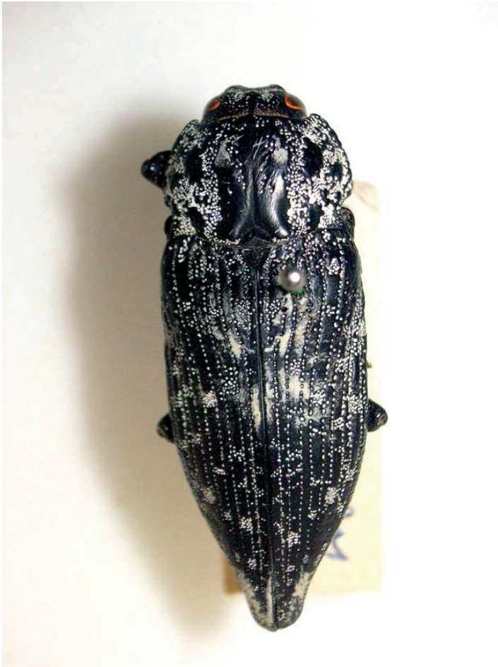
Figure 3. The flat-headed borer jewel beetle, Capnodis excisa . This specimen was collected by J. N. B. Brown in the Madam area, UAE; originally in the Abu Dhabi Collection, it is now housed in the JAAEN-HG Insect Collection in Al Ain.

of the Abu Dhabi ENHG newsletter Focus for November 2007 (ENHG 2007). Even more interesting was the cover photograph purporting to show Julodis euphratica , but which actually shows a different species, which is almost certainly J. candida . If this is correct, then this is the only known photograph of this species and is remarkable in that it not only shows the creamy white pulverulence mentioned above, but also orange-yellow longitudinal stripes along the centre of the pronotum and along the margins of the elytra that are not obvious either in the dead insect (Fig. 1) or the original description by Holyński (1996).