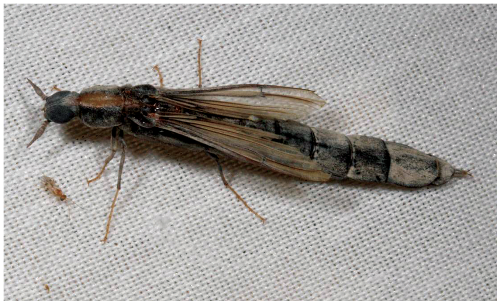
Figure 5. A live example of a very strange beetle belonging to the genus Atractocerus (Coleoptera: Lymexylidae). This insect was photographed and collected at a MVT by B. Howarth in September 2008 in the Emirate of Fujairah and represents a new species and genus record for the UAE.