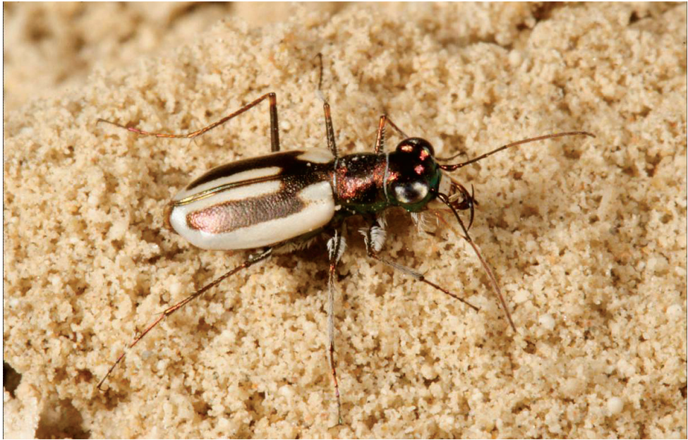
Figure 4. Callytron monalisa . A living specimen of Callytron monalisa , one of two specimens collected by B. Howarth in 2007 on Reem Island, Abu Dhabi. This rare species is known only from the Iranian side of the Arabian Gulf.

Beetles belonging to the small family Lymexylidae develop in the wood of fallen or damaged trees, feeding on fungus that grows in tunnels bored by the larvae and is an unusual family to find in the UAE. A single specimen attributable to the genus Atractocerus was taken at a mercury vapour light trap by BH on the 19th September 2008 in the Fujairah emirate. It is a soft-bodied beetle with only rudimentary wing-cases or elytra (Fig. 5) making it hardly recognisable as a beetle. It too is a new record for the UAE.