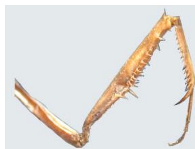
Image 22. Cheddikulama straminea Fore femur

groove proximally placed, tibia with 16 internal, 11 external spines; both wing shorter than abdomen; fore wing opaque at costal area, anal, discoidal area semi transparent; hind wing hyaline with characteristic colorations.