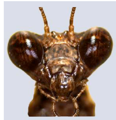
Image 10. Elmantis trincomaliae Head - frontal view