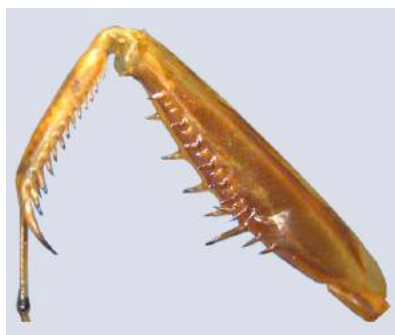
Image 19. Hierodula ventralis Fore leg