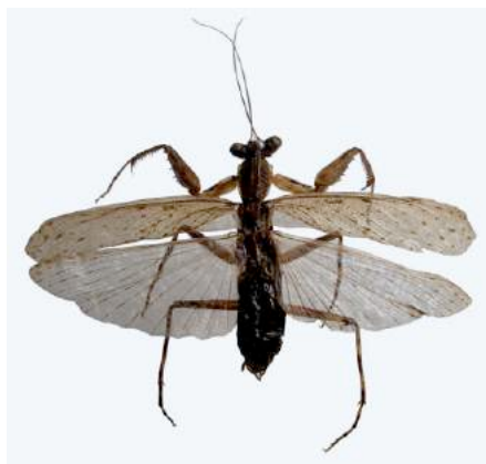
Image 12. Humbertiella similis Male