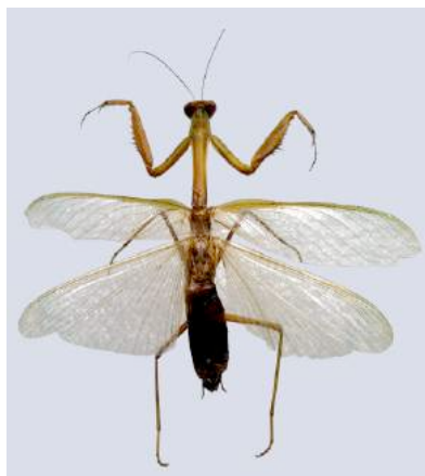
Image 16. Hierodula ventralis Male