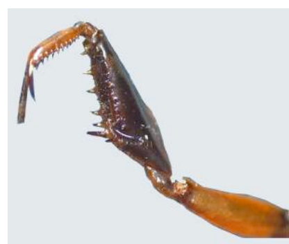
Image 7. Amantis saussurei Foreleg