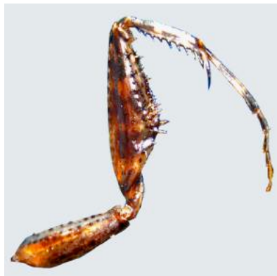
Image 11. Elmantis trincomaliae foreleg