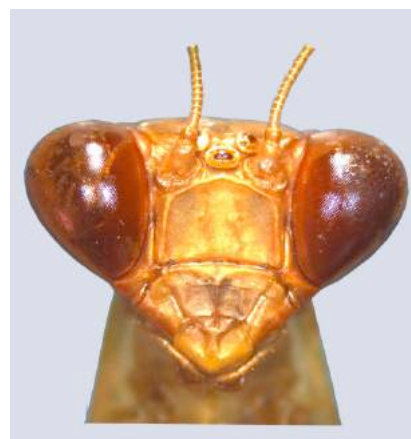
Image 17. Hierodula ventralis Frontal view