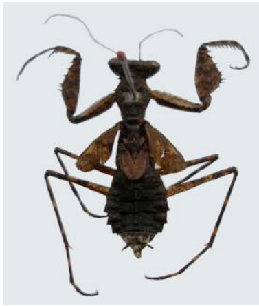
Image 9. Elmantis trincomaliae Female