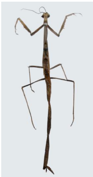
Image 20. Cheddikulama straminea Frontal view