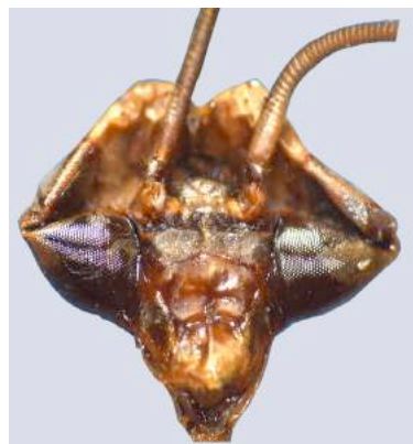
Image 21. Cheddikulama straminea Frontal view