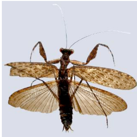
Image 8. Elmantis trincomaliae Male