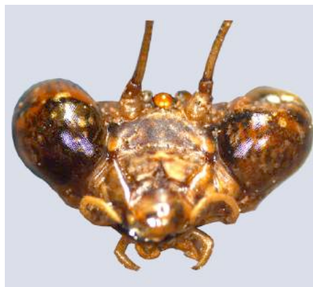
Image 14. Humbertiella similis Frontal view