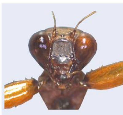
Image 6. Amantis saussurei Head - frontal view