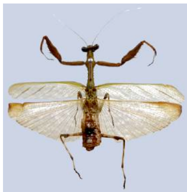
Image 2. Acromantis insularis Male