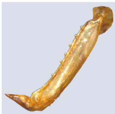
Image 18. Hierodula ventralis Fore coxa