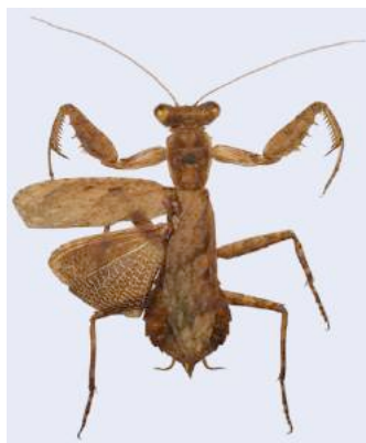
Image 13. Humbertiella similis Female