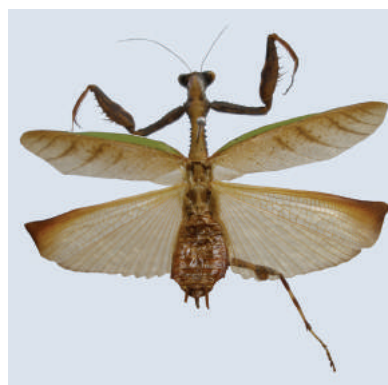
Image 1. Acromantis insularis Female

Abbreviations: FW - Fore wing; PN - Pronotum; TL - Total Length; WS - Wildlife Sanctuary.