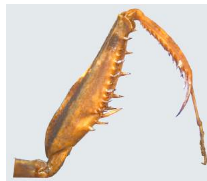
Image 4. Acromantis insularis Fore - femur

metazona, 4-5 spines present in the anterior margin. Femur: dorsal middle region with a hump, four external spines, four discoidal spines and 13 internal spines, longer internal spines black at tip and base, claw groove placed at proximal end, wings longer than abdomen; fore wings less densely reticulated, costal area truncated at tip.