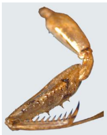
Image 15. Humbertiella similis Fore-leg