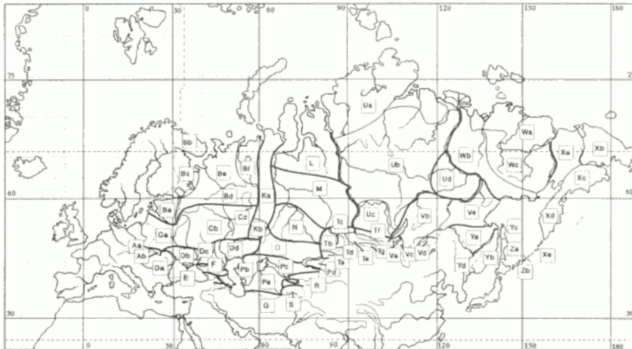
Figure 1. Map of Russia and adjacent lands showing the territory covered by the present list (see also text).

Each (sub)region is outlined by geographical, mainly geomorphological, borders. Besides, data are provided on the dominating relief, vegetation and soil type(s), all concluded by the administrative units encompassed by those borders.