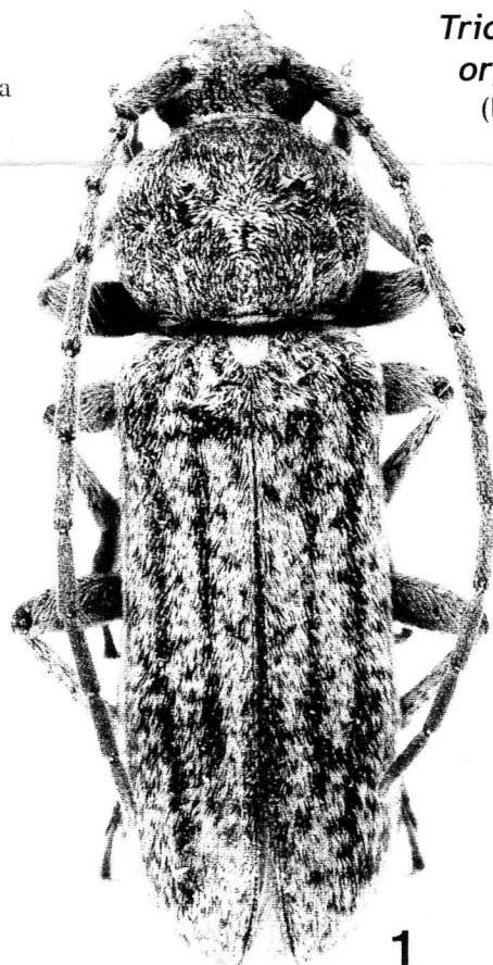
Fig. 1. Trichoferus georgioui sp. nov. — Holotypus ♂, Cyprus, Pafos: Vretsia, m 500.

During 1999 and 2000, the insect fauna of the south-western part of Cyprus was investigated through wine traps placed on various tree species, attracting several Cerambycidae species. Among these was the new species of Trichoferus described below.