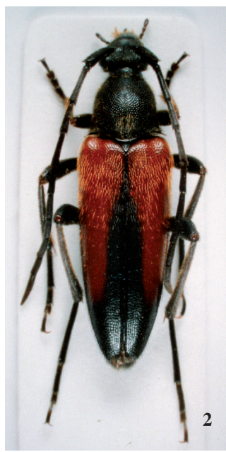
Figs. 1, 2 – Stenurella pamphyliae n. sp. - Holotype ♂ and paratype ♀.