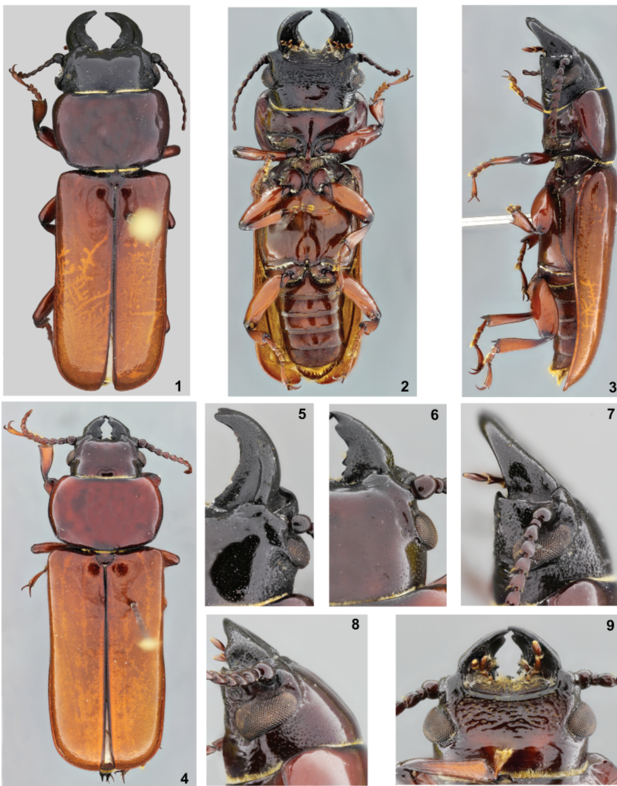
Figures 1–9. Parandra (Parandra) barclayi , new species. 1) Holotype male, dorsal habitus. 2) Holotype male, ventral habitus. 3) Holotype male, lateral habitus. 4) Paratype female, dorsal habitus. 5) Holotype male, head, dorsal. 6) Paratype female, head, dorsal. 7) Holotype male, head, lateral. 8) Paratype female, head, lateral. 9) Paratype female, head, ventral.