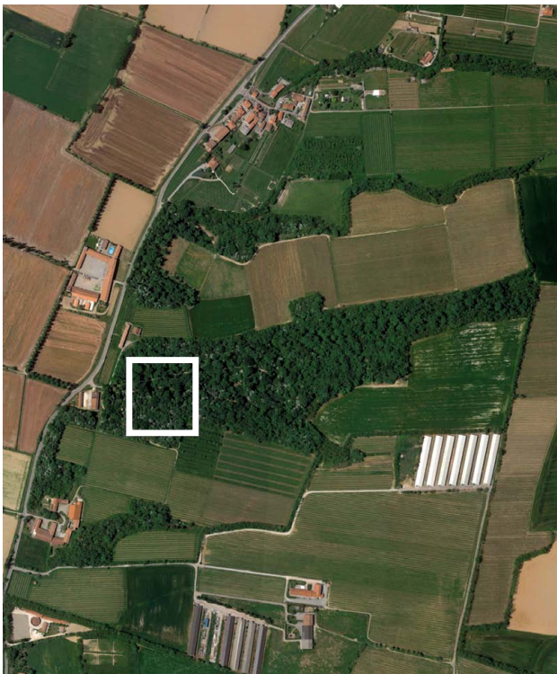
Fig. 3 – The Colombere wood: into the white rectangle, the research area; (after Google Earth, modified).

by using a litter-reducer. Leave litter was collected in a site dominated by oak trees ( Quercus robur L., 1753) and moss was collected from an oak tree recently fallen due to wind: 22 specimens were collected on October 22 nd , 119 on November 3 rd , 7 on November 4 th and 7 on November 18 th . After 18 th November, no further research has been carried out. Dissections were performed by one of us (T. Y.) under a microscope (Nikon SMZ1270) according to the methods of Yoshida & Hirowatari (2014). A photo image of the habitus (Fig. 4) was taken using a digital camera (Canon EOS 7D) with a macro lens (Canon MP-E 65 mm). A photo of the male genitalia (Fig. 5) was taken using a digital camera (Olympus E-5) attached to a microscope (Olympus BX43). Composite images were produced using the image processing software Combine ZM. Images were retouched using Photoshop 6.0 (Adobe Systems Inc.).