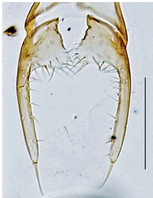
Fig. 5 – Parameres of a male examined; scale bar: 0,1 mm; (photo: Takahiro Yoshida).