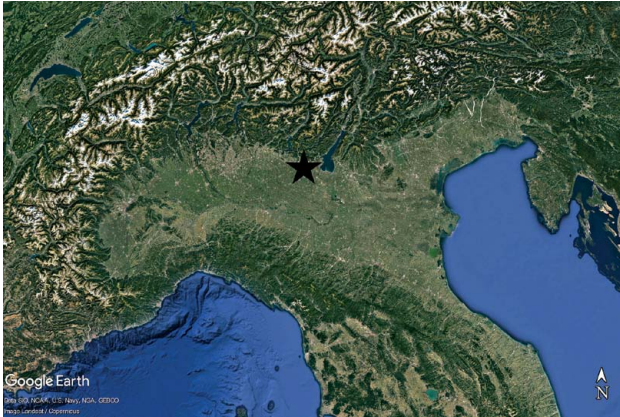
Fig. 2 – Localization of the Monte Netto hill in Italy (star); (after Google Earth, modified).

During 2018 a total of 155 Psammoecus specimens were collected between the end of October and mid-November,