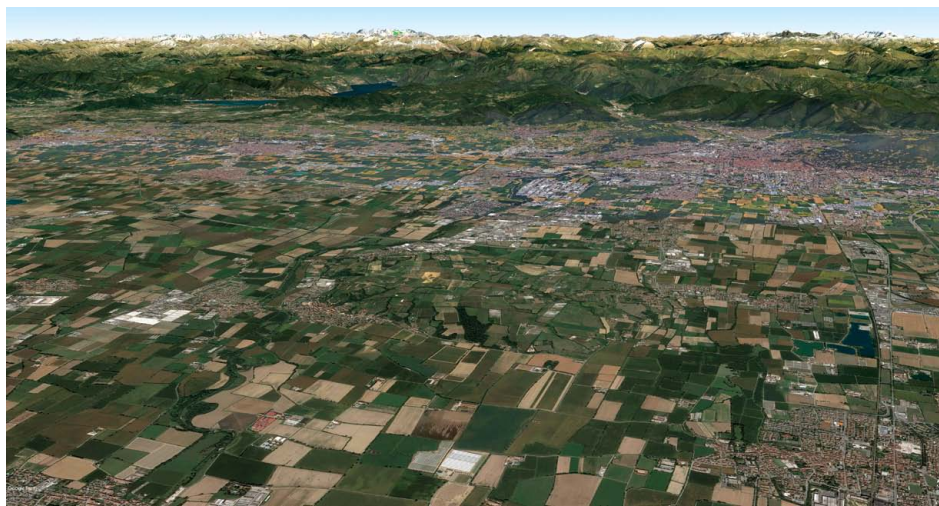
Fig. 1 – The Monte Netto hill (Italy, Lombardy, Brescia province; (after Google Earth , modified).

The Monte Netto hill (coordinates: 45°26'54.95"N 10°8'56.84"E) is a plateau isolated in the plains of Capriano del Colle, Flero and Poncarale municipalities (Figs 1, 2). It is located ca. 10 km south-west from Brescia; its maximum altitude is ca. 133 m a.s.l., rising about 30 m above the surrounding plains (Tira et al. 2010). The Colombero wood is